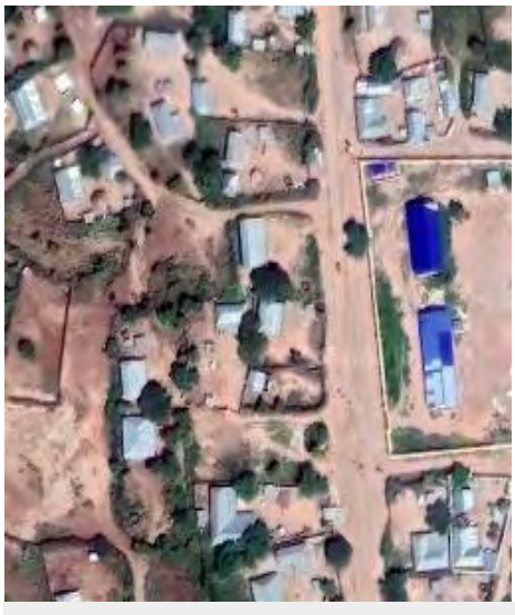
High level map of sites