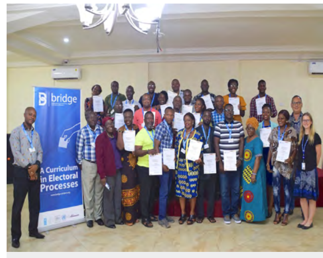
BRIDGE Training participants and facilitators: Voter Registration Module

new staff, middle-level managers and directors, and logisticians. Three modular courses, namely Introduction to Elections Administration, Voter Registration, and Elections Logistics were delivered by the team of international and national facilitators, 74 staff (56 males and 18 females) benefited from the training. The training was highly valued by the NEC, as the Election Management Body is preparing for the mid-term elections in 2020, and a Constitutional referendum, including a major voter roll update process. The BRIDGE training was therefore intended to enhance a capacity of the NEC staff to perform their duties and responsibilities effectively, as well as to strengthen the electoral institution, to professionally execute its mandate for upcoming electoral processes and beyond. To enhance national ownership and strengthen national capacities, the project will seek to support NEC in organising own training for external electoral stakeholders as part of the upcoming project cycle.