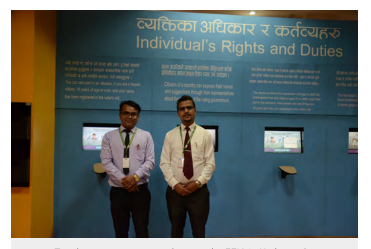
Teachers accompany students at the EEIC in Kathmandu.

workshops and provincial dialogues from the past months culminated in a nationallevel workshop that was organised this month. In the final workshop, participants discussed issues that risk leading to electoral violence in the longer term. It will present the findings to ECN.