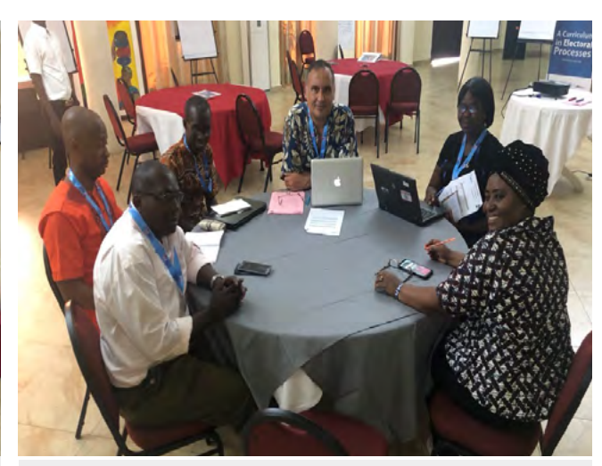
\ensuremath{\mathsf{BRIDGE}} Training: Facilitators preparing for the next day session