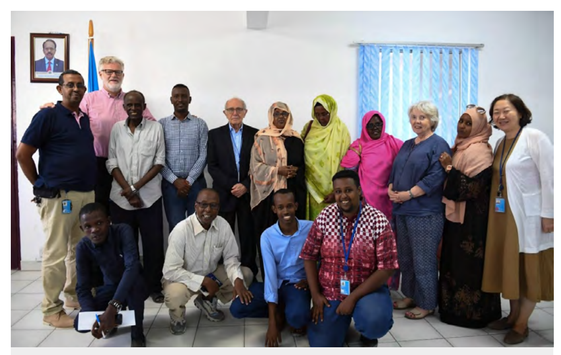
4 December 2019. Judge Kriegler and IESG staff meet with members of civil society in Mogadishu.