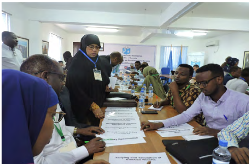
Newly recruited NIEC staff engaged in an induction workshop on electoral principles, Mogadishu, 8-14 July 2019.

The workshop was conducted by electoral experts from NIEC, IESG and the Bringing Unity, Integrity, and Legitimacy to Democracy programme (BUILD, implemented by Creative Associates International). During the workshop, important topics with relates to the electoral cycles were introduced to the participants such as electoral dispute resolution, electoral legal frameworks, electoral laws formulation, capture of VR centers, voter education, voting/polling, vote counting/tallying, announcing the winner and later evaluate the conduct of the elections.