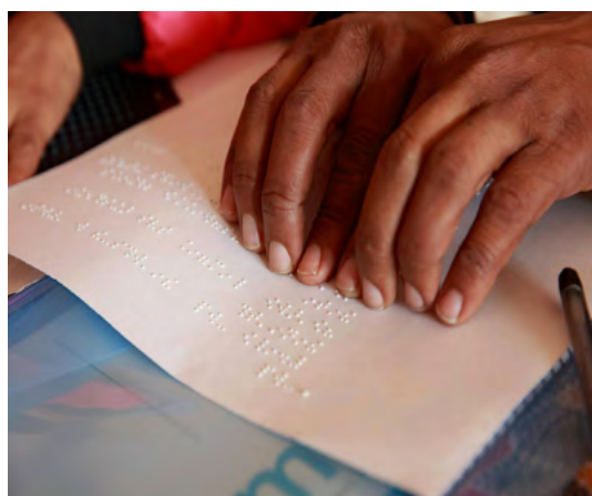
ESP signed an agreement with the Nepal Blind Association and National Federation of the Deaf Nepal.