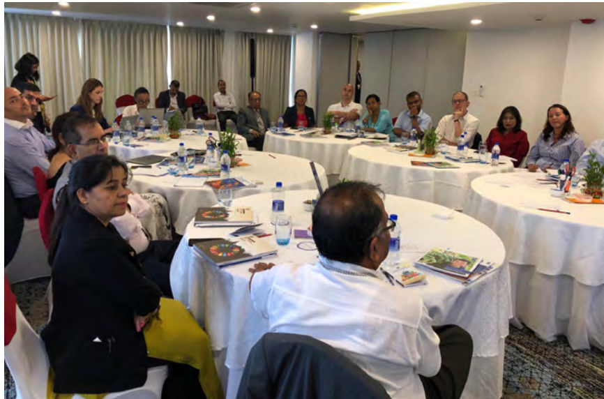
Interaction programme on SDG 16+.

. The brainstorming session helped generate feedback from the stakeholders present, who stressed that UNDP's support on issues of inclusion, integrity and accountability is needed through government institutions and CSOs vis-à-vis the new federal governance structure of the country. The programme was the first of its kind.