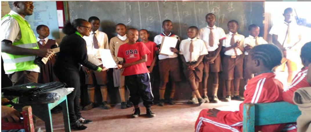
IEBC officials support elections of Oaklands Junior School

thirds constitutional gender principle in their leadership. Consultations included deliberation on the legal framework for inclusion of special interest groups pursuant to Article 100 of the Constitution of Kenya 2010. Through the support of the project, the Office of the Registrar of Political Parties led the revitalization of the PPLC.