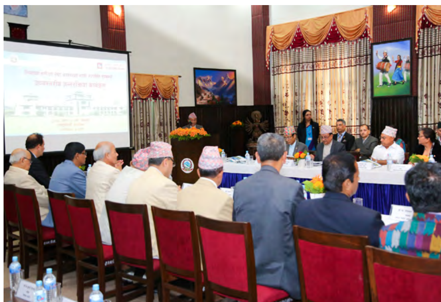
The Chief Election Commissioner addressing the high-level interaction at the President's Office.