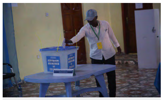
Baidoa by-election, 28 January 2019.

On 28 January, the NIEC conducted by-election in Baidoa for a vacant seat in Federal House of the People. The by-election was conducted according to the procedures of the '2016 clan-based limited franchise electoral process', with 51 clan-members voting for the two candidates from their respective clan.