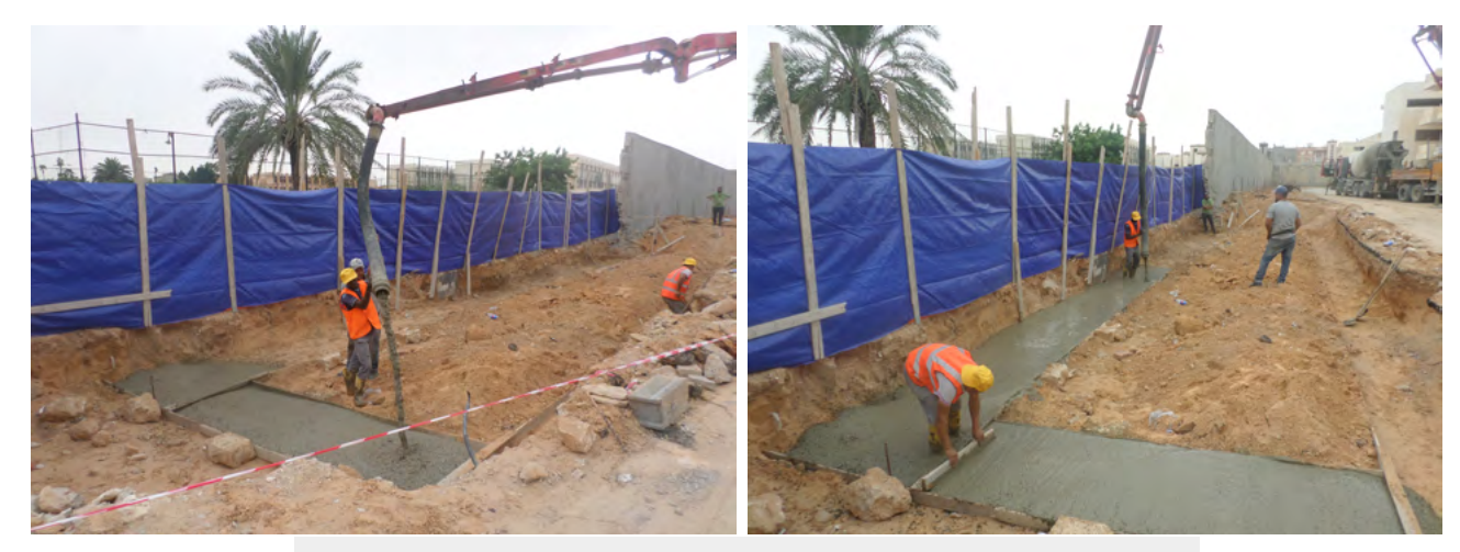
Construction works, HNEC new site, Sidi Al Masri, October 2018.

- Regular electoral assistance coordination meeting will be convened by UNEST and attended by donors, electoral technical assistance providers and the UN agencies.