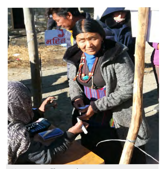
Voter at a polling station.

to the concerned actors. From 19 to 21 November, this was complemented by interactions in each of the seven provinces in which ECN presented this information to main electoral stakeholders (political parties, media, human rights and civil society organizations, local government and security officials). In addition to EDR, the electoral code of conduct as well as risks of violence and mitigation measures were discussed in these events.