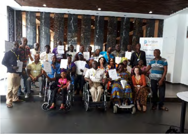
Group photo of participants (AVETOs and DPOs).