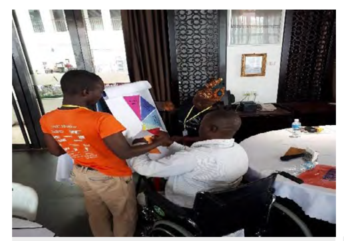
Activity on mapping the electoral cycle.

The following topic were covered: legal framework; international standard-election laws and conventions; electoral cycle, election stakeholders, justice and representation; introduction of electoral systems; majoritarian electoral systems; concepts of voter education, civic education and voter information; introduction to electoral access; what does access mean; access in election phases; developing an access strategy; integrity of elections.