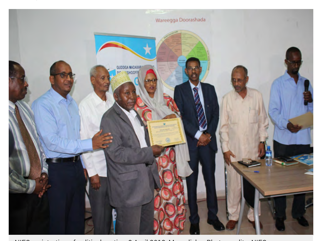
NIEC registration of political parties, 8 April 2018, Mogadishu.

The list with the registered political parties can be found <a href="here.">here.</a>