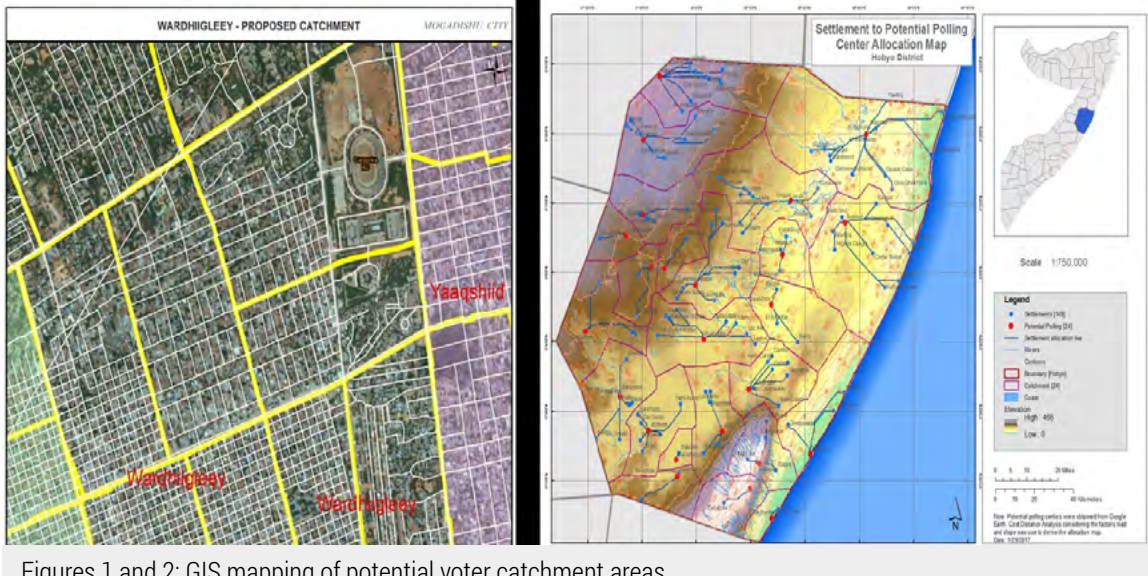
Figures 1 and 2: GIS mapping of potential voter catchment areas.

On 18 and 19 April, UNDP initiated a micro-capacity assessment of the NIEC, reviewing the institution's administrative and financial management system, and help to decide the appropriate cash transfer modality and related assurance activities. The assessment includes recommendations for further capacity development of the NIEC by the project.