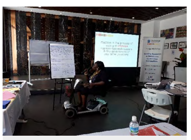
Presentation of group work on the importance of elections.

In the last week of April, the project funded a three-day Building Resources in Democracy, Governance and Elections (BRIDGE) workshop on Introduction to Electoral Administration aimed at enhancing the electoral awareness of the AVETOs and members of Disabled Persons Organizations in Sierra Leone. This activity is in line with the project outcome to develop the capacities of the electoral stakeholders, in particular persons living with disability (PWD).