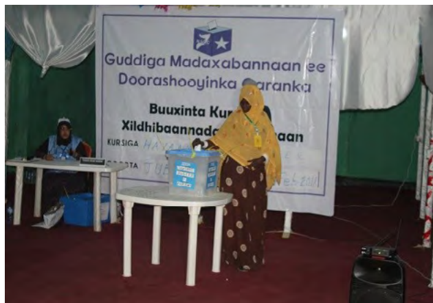
NIEC by-elections process in Kismayo, Jubaland. 15 February 2018.

On 15 February, in Kismayo, Jubaland, and on 26 February, in Mogadishu, the National Independent Election Commission (NIEC) organised by-elections for two vacant seats of the Federal House of the People, respectively concerning a specific clan from Jubaland and one of Somalilanders. The NIEC followed the procedures of the limited franchise electoral process in 2016, including the provision of 51 clan-based voting delegates and a formal candidate campaign period. The UN Integrated Electoral Support Group provided polling and counting training according to the procedures.