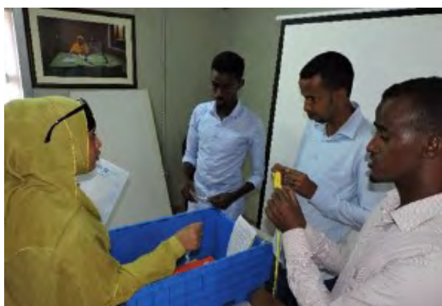
IESG training to NIEC staff members on polling and counting procedures. Mogadishu, February 2018.

On 28 February, the NIEC concluded in Mogadishu its nationwide consultations with sub-national stakeholders in each of the Federal Member States (Puntland, Galmudug, Hirshabelle, South-West, and Jubaland), the capital region of Benaadir, and with the Somaliland community in Mogadishu. The meetings were attended by regional officials, traditional elders, political parties, religious leaders, women’s and youth groups, and civil society organisations. Widespread feedback from the Somali public strongly supports the FGS’ objective to reach universal multi-party elections in 2020 beyond clan-based power sharing arrangements. The NIEC plans to conduct in March additional out-of-country consultations with the Somali diaspora community in the United States, Canada, Europe and Kenya. The final consolidated report including recommendations to the FGS is expected to be submitted by the NIEC in the upcoming period.