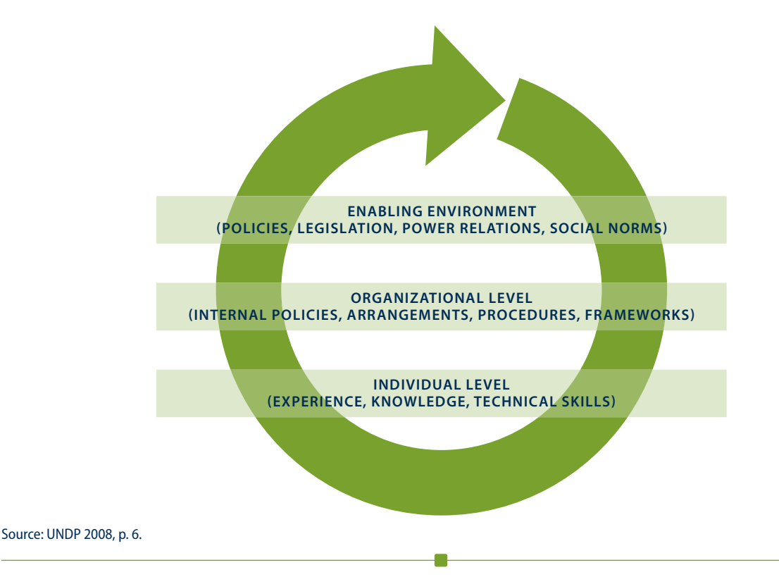
FIGURE 2: UNDP SYSTEMIC APPROACH TO CAPACITY DEVELOPMENT

Capacity development can be an integral part of any strategy for meaningful participation. The UNDP approach to capacity development "reflects the viewpoint that capacity resides within individuals, as well as at the level of organizations and within the enabling environment."<sup>15</sup> These three levels form an integrated system,<sup>16</sup> as illustrated in Figure 2.