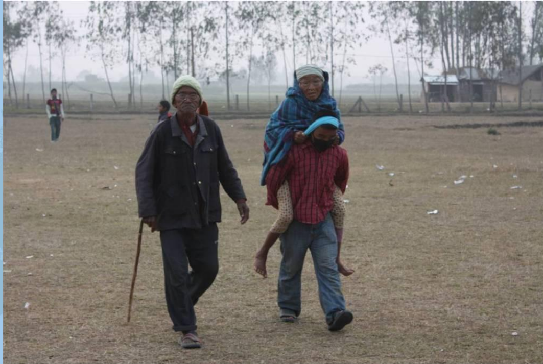
Old lady Aged 74 at registration center with her husband and Grandson

The Rolls Right, The Poll Right Your vote is a valuable thing