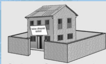
District Election Office

→ Data and forms transferred at completion of each RC