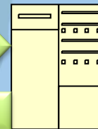
Central Storage Data Matching & Checking