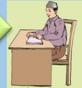
form checking voter authentication

→ Voter attends registration centre at nominated time