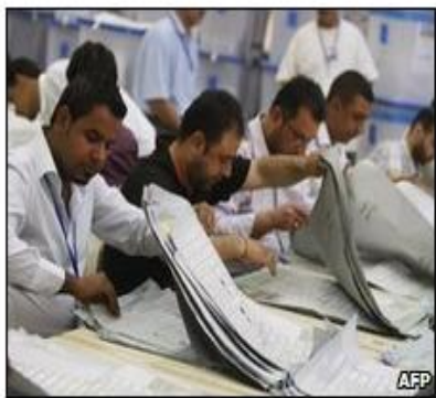
There have been complaints of fraud and irregularities in the vote counting

Iraq's election commission has rejected calls from the president and prime minister for a recount of votes cast in the general election on 7 March.